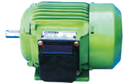
Frame 905 B3