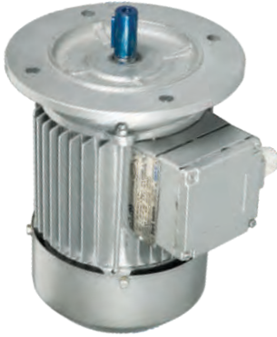
Frame 80 B5